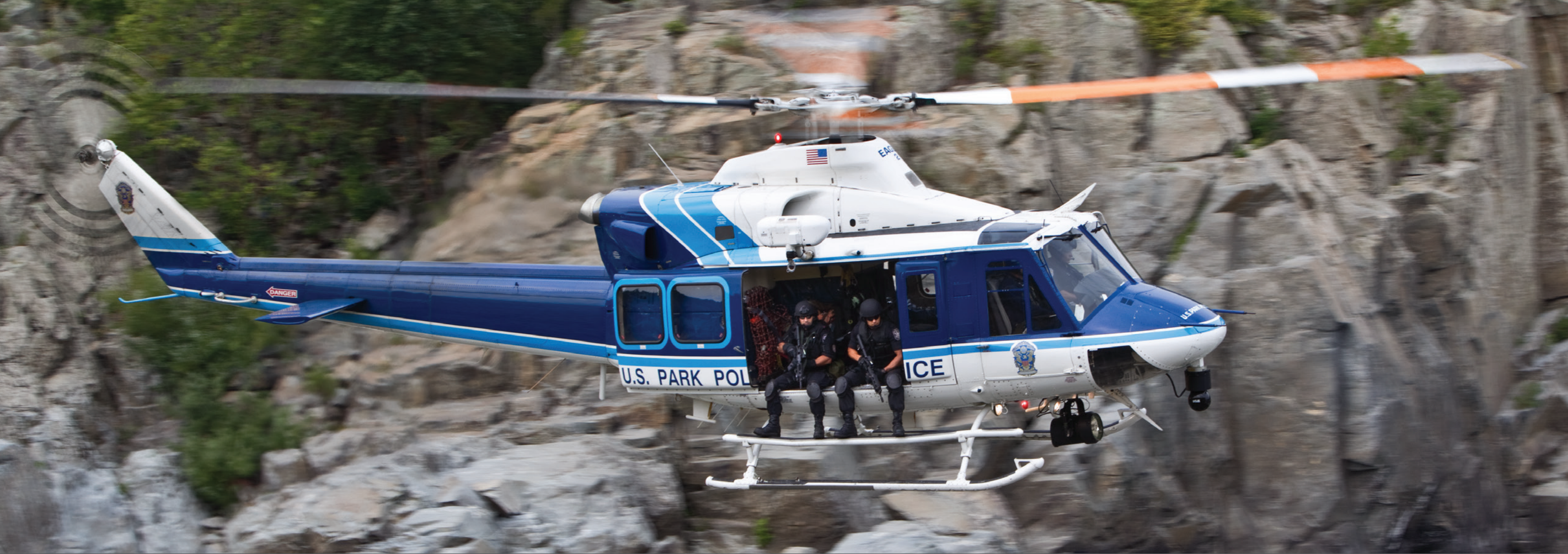
BELL 412EP | A daily workhorse with an expansive cabin providing multi-mission flexibility.